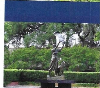
Savannah - the "Belle of Georgia"

Diamond Tours inc. Bringing Group Travel to a Higher Standard®