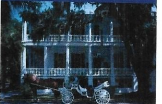
You'll feel like you've traveled back in time!